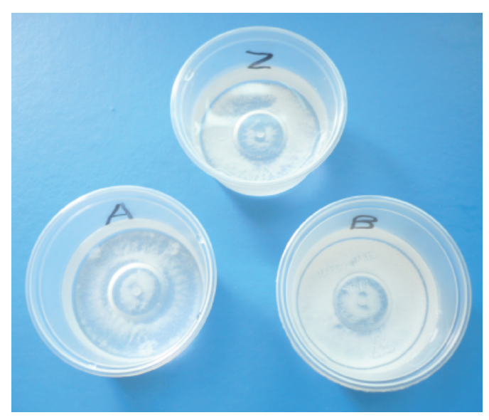
Fig. 2. Incomplete dissolution of stavudine capsules in water (Z = Zerit, A = Aspen Stavudine, B = Stavir).

The contents of Stavir capsules were extremely difficult to disperse in water despite prolonged agitation. Their contents appeared to be partially hydrophobic, floating persistently on the meniscus of the sample. Consequently, recovery of active drug was reduced (Table I). However, because of the small sample size, the difference in recovery of active drug from solution when comparing Zerit with Stavir did not reach statistical significance (p=0.1730).