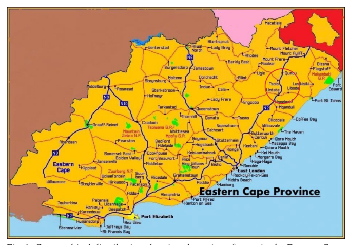
Fig. 2. Geographical distribution showing clustering of cases in the Eastern Cape Province (red circle).

In a Turkish report of 100 pulmonary hydatidosis cases, the largest group comprised of school-aged children aged 3 - 9 years.<sup>[2]</sup> In our study, the age distribution was comparable. In another Turkish study, the children were found to be older, with a mean (standard deviation) age of 10.2 (3.9) years.<sup>[14]</sup> The number of males with hydatid cysts exceeded that of females at a ratio of 6:1. This male predominance has been noted in previous studies.<sup>[11,15-17]</sup> In one study, the male prevalence was 76%.<sup>[15]</sup> This may be related to traditional practices wherein the rearing of livestock is left to males, especially young boys. The risk factors for hydatid disease are well known, and include exposure to animals such as dogs, sheep, cats and cattle. In the current study the subjects reported exposure mainly to dogs, sheep and cattle.